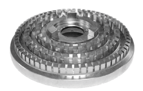
Tooth and Chamber tool